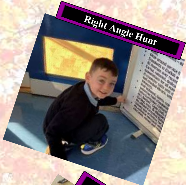
Right Angle Hunt